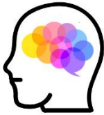
Brain Health 101

You are My Sunshine, my only sunshine You make me happy when skies are gray You'll never know, dear, how much I love you. Please don't take my sunshine away. The other night, dear, as I lay sleeping, I dreamt I held you in my arms. When I awoke, dear, I was mistaken, So I hung my head and cried. You are My Sunshine, my only sunshine You make me happy when skies are gray You'll never know, dear, how much I love you. Please don't take my sunshine away. Please don't take my sunshine away.