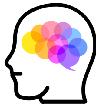
Brain Health 101